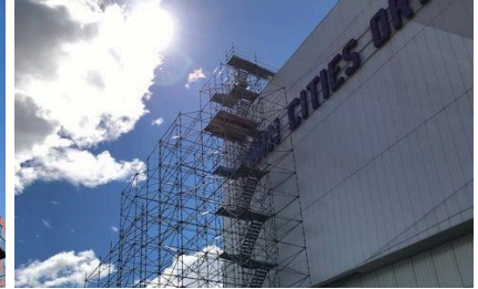
MN Vikings Indoor Practice Facility, 2021