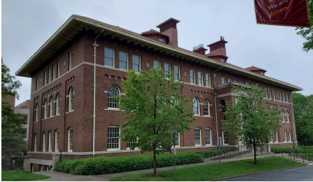
Haecker Hall, 2021